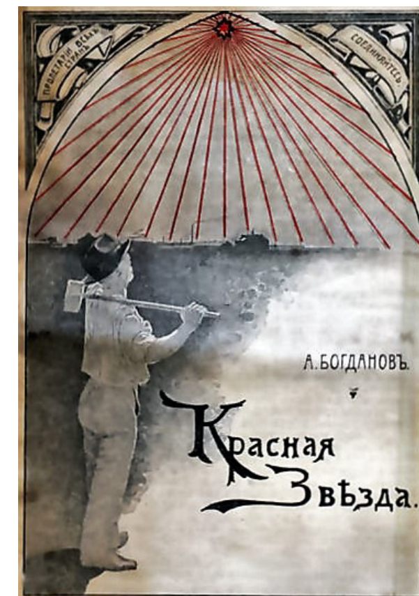
Fig. 6. Cover Red Star by Aleksandr Bogdanov, 1908.

There was a good deal of philosophising about a Russian utopia well before the revolution, particularly in popular books. The favourite volume in the genre was Красная Звезда (Red Star), published in 1908 by the Bolshevik physician and science-fiction writer Aleksandr Bogdanov (Fig. 6). The book is about a Russian scientist who travels to Mars to study the socialist system there. On returning to Earth he tells of what he has learned. The constructivist architecture that flourished in Russia in the 1920s