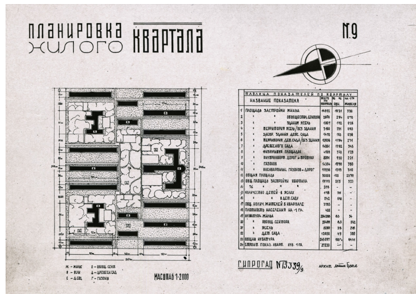
Fig. 3. Drawing for KhTZ signed by Lotte Beese, 1932.