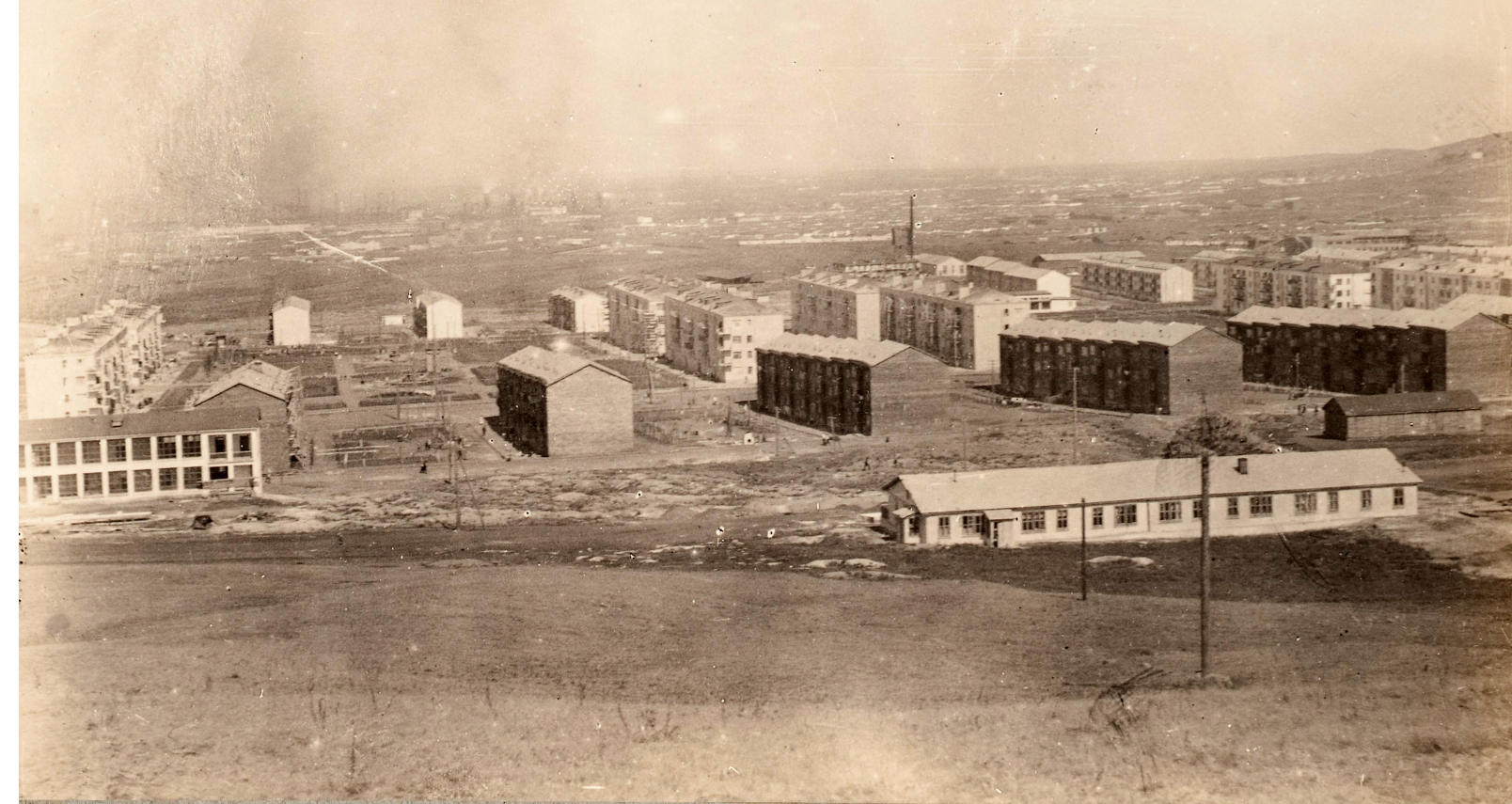
Fig. 7. Dwellings sotsgorod Magnitogorsk with at the left crèche designed by Grete Schütte-Lihotzky, 1932-35.

In the years when Beese lived and worked in the Soviet Union, there was a shift in ideas about what architecture should mean. The 1932 worldwide design competition for the Palace of the Soviets, with proposals submitted by such figures as Le Corbusier, Walter Gropius and Auguste Perret, as well as the less famous Dutch architect Han van Loghem, is generally seen as a major turning point in Russian architecture. The avant-garde architects' designs were rejected in favour of one submitted by the Russian Boris Iofan – a megalomaniac neo-classicist palace. Buildings – including to some extent those in the sotsgorods would henceforth have to have historical, classical features.