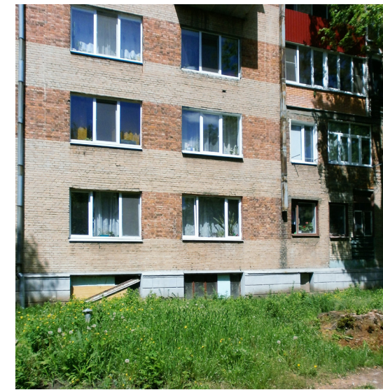
Fig. 4. Dwellings KhTZ, Kharkov, 2015.