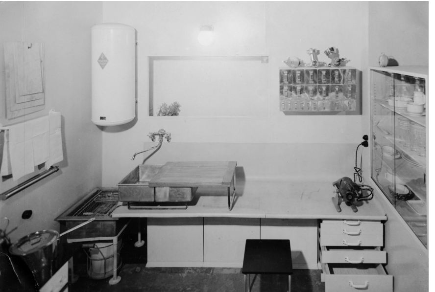
Fig. 5. Minimum Kitchen of the Minimum Apartment Exhibition in the Finnish Society of Art and Craft Fair, 1930, Taidehalli, Helsinki.

For the Minimum Apartment Exhibition in the 'Finnish Society of Art and Craft Fair' that took place in Helsinki in 1930, the Aaltos designed a modern minimum home comprised of living/dining room, kitchen and two bedrooms. Aino Marsio-Aalto designed the kitchen and its different utensils, a table and a sideboard for the dining room and curtains for the bedroom (Fig. 5). During this period Aino and Alvar Aalto's ideas in design in the domestic space were influenced by the social transformation and the new role of women in society. Alvar Aalto displayed his ideas about this topic in 1930: