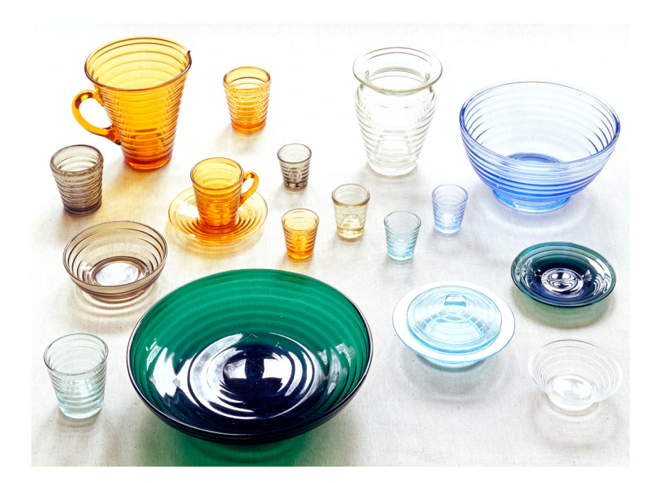
Fig. 3. Bölgeblick Series.

The objects designed by Marsio had a simple shape, with no aesthetic boasting, according to the