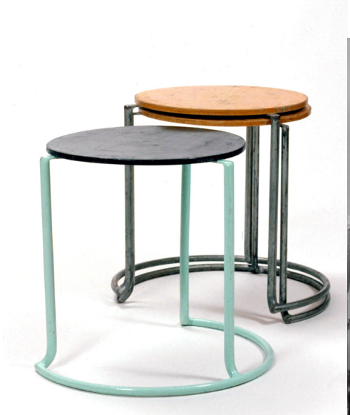
Fig. 4. The Paimio stool in different finishing's.

The stool, together with two armchairs –41 and 42– designed by Alvar Aalto for the hospital, formed part of a programme of modern furniture launched in 1932, after being shown in the Scandinavian Housing Fair in Helsinki in the Standard Furniture section. <sup>14</sup> This furniture would be produced and manufactured by Finnish manufacturers, and it is still being made today by the Artek company. <sup>15</sup> All the furniture designed by