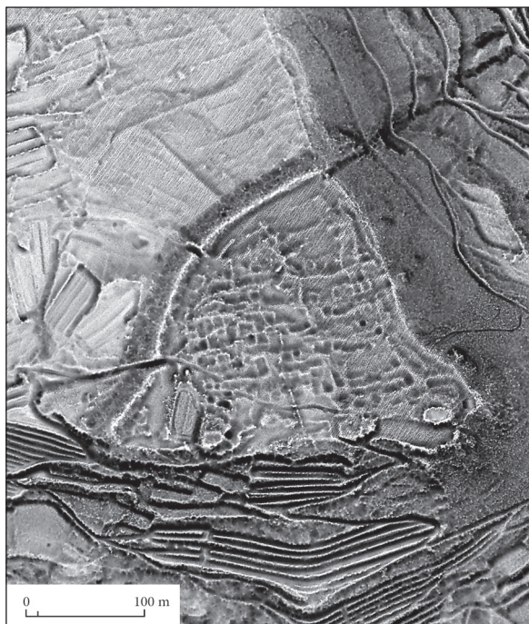
Sl. 2: Sv. Pavel nad Planino. Poznorimska naselbina. Lidarski posnetek.

Fig. 2: Sv. Pavel above Planina. Late Roman settlement. LiDAR-derived digital elevation model.