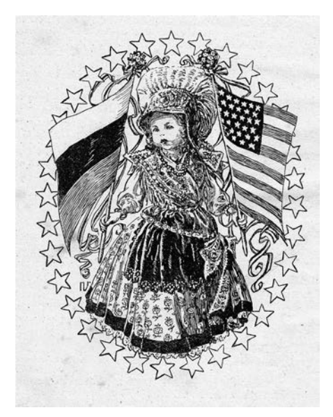
A girl wearing a traditional costume, holding a Carniolan and an American flag.

people of parochial or liberal, or socialist persuasions, especially in the era between the two wars and after World War II (Praček Krasna 1991).